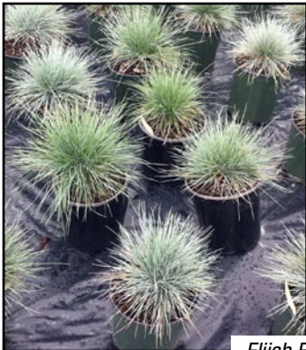
Elijah Fescue Blue