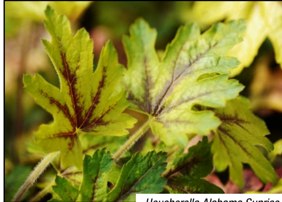
Heucherella Alabama Sunrise