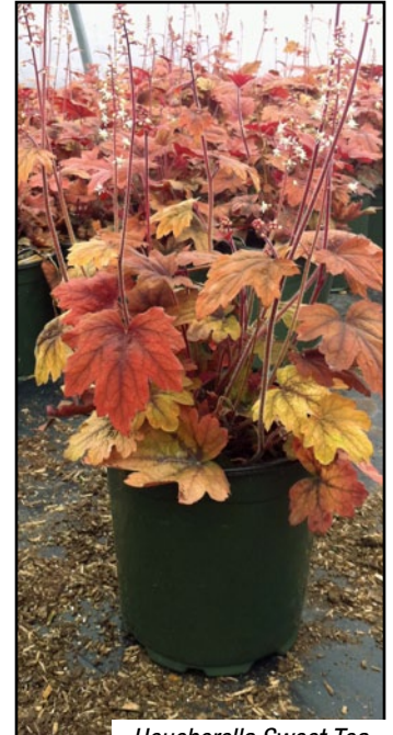
Heucherella Sweet Tea