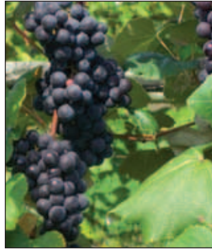
Grape Concord Seedless