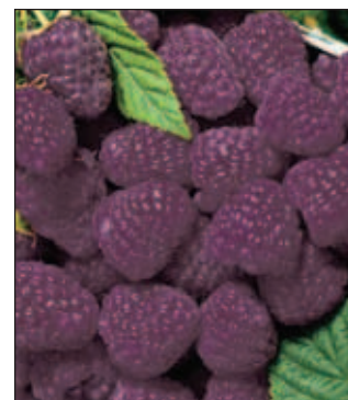
Raspberry Royalty Purple

Raspberry Royalty Purple - Large, red-purple berries in late summer-fall. Dark green, hairy foliage with thorns. Small white flowers. Attracts birds and wildlife. 4-6' Tall X 4-6' Wide. Zone 4. ☀️ ☁️