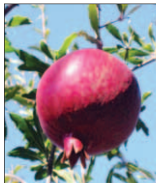
Pomegranate Angel Red™