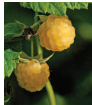
Raspberry Fall Gold

Raspberry Fall Gold - Large, golden-yellow berries in late summer-fall. Dark green, hairy foliage with thorns. Small white flowers. Attracts birds and wildlife. 4-6' Tall X 4-6' Wide. Zone 4. ☀️ ☁️