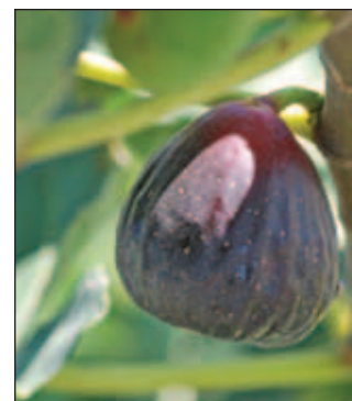
Fig Texas Everbearing