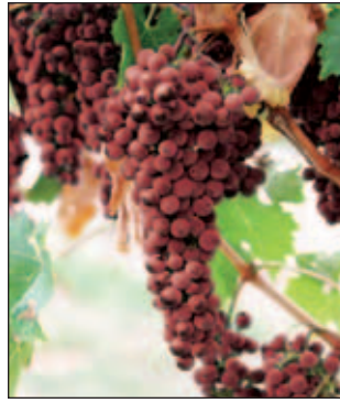
Grape Cabernet Sauvignon