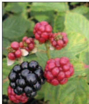
Blackberry Navaho PP#06679