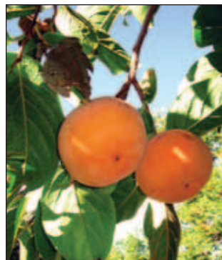
Persimmon Japanese Fuyu