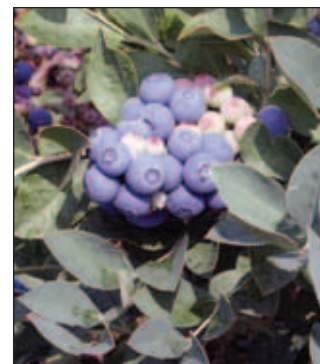
Blueberry Premier Rabbiteye

Blueberry Premier Rabbiteye - Medium powdery blue fruit. Good for eating and canning. Great landscape plant. Dark blue-green foliage with orange-red in the fall. White bell-shaped flowers. 10' Tall X 8' Wide. Zone 7. ☀️☁️