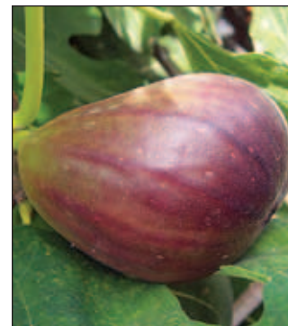
Fig Brown Turkey