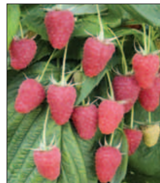
Raspberry Autumn Bliss