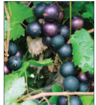
Grape Muscadine Cowart