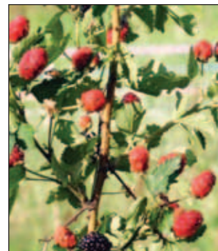
Blackberry Prime-Jim PP#15788