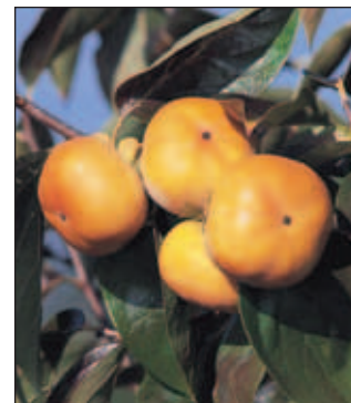
Persimmon Japanese Jiro