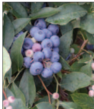
Blueberry Tifblue Rabbiteye