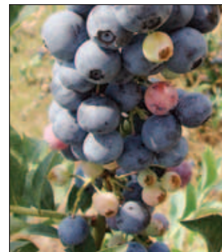
Blueberry Climax Rabbiteye

Blueberry Climax Rabbiteye - Medium to large dark blue fruit in late May. Good for eating, canning, and freezing. White flowers. Dark green foliage and fiery red in the fall. 6+' Tall X 6'+ Wide. Zone 6. ☀️☁️