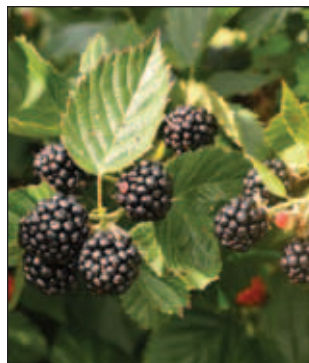
Blackberry Triple Crown