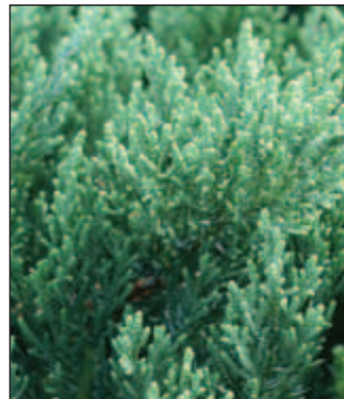
Juniperus 'Parsoni' Parsoni Juniper

Parsoni Juniper - Prostrate grower. Attractive accent, ground cover, massing plant. 18-24" Tall X 6-8' Wide. Zone 4. ☀️ 3D - #3 Can 12/15" #3 Can 15/18" #3 Can 18/21" #3 Can 21/24"