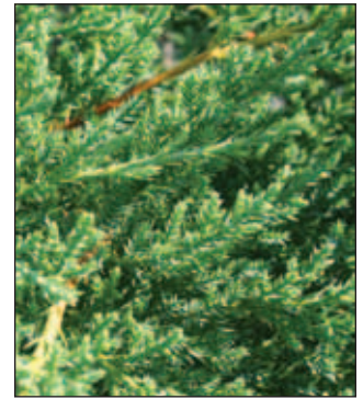
Juniperus 'Nick's Compact' Nick's Compact Pfitzer Juniper