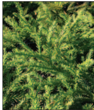
Cryptomeria 'Gyokuryo' Gyokuryo Japanese Cryptomeria

Gyokuryo Cryptomeria - Broad, pyramidal form. Dark green needle-like foliage. Good specimen, massing plant. 8-10' Tall X 5-6' Wide. Zone 5. ☀️☁️ 3Q - #3 Can 21/24"