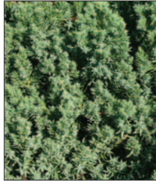
Juniperus 'Procumbens Nana' Procumbens Nana Juniper

Procumbens Nana Juniper - Rich, green foliage. Very low, dense form. Excellent ground cover, accent plant. 12" Tall X 6' Wide. Zone 5. ☀️ 3D - #3 Can 12/15" #3 Can 15/18" #3 Can 18/21"