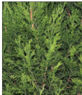
Juniperus 'Spartan' Spartan Juniper

Spartan Juniper - Bright green columnar form. Good foundation, specimen, accent plant. 15' Tall X 5'. Zone 4. ☀ 15D - #10 Can 5/6'