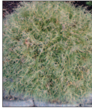
Thuja 'Linesville Dwarf' Linesville Dwarf Arborvitae