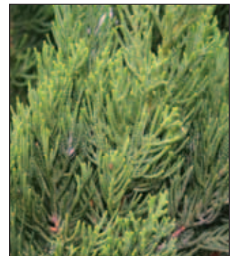
Juniperus 'Torulosa' Hollywood Juniper