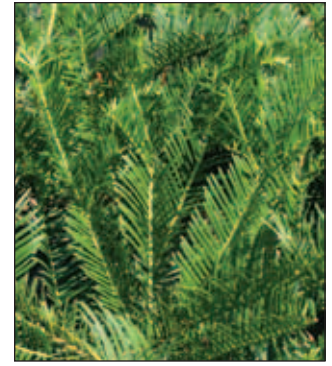
Cephalotaxus 'Prostrata' Prostrata Plum Yew