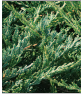
Juniperus 'Bar Harbor' Bar Harbor Juniper

Bar Harbor Juniper - Low growing, grey-green foliage. Spreading form. Good hillside, ground cover plant. 8" Tall X 10' Wide. Zone 5. ☀️ 3D - #3 Can 12/15" #3 Can 15/18" #3 Can 18/21" #3 Can 21/24"