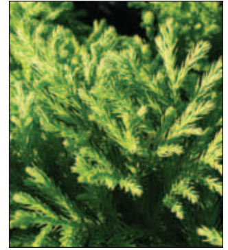
Cryptomeria 'Globosa Nana' Globosa Nana Japanese Cryptomeria