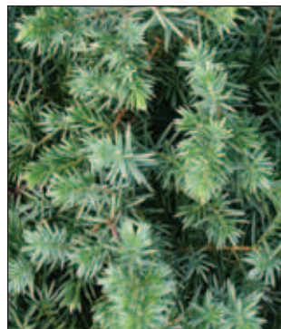
Juniperus 'Blue Pacific' Blue Pacific Juniper

Blue Pacific Juniper - Improved conferta type with blue-green, needle-like foliage. Salt tolerant. Good ground cover, bank plant. 12" Tall X 8' Wide. Zone 5. ☀ 3D - #3 Can 12/15" #3 Can 15/18" #3 Can 18/21" #3 Can 21/24"