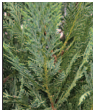
Cupressocyparis 'Leylandii' Leyland Cypress

Leyland Cypress - Fast growing. Bright green foliage. Pyramidal form. Good for hedge, screening. 30-60' Tall X 15-20' Wide. Zone 5. ☀️ 3C - #3 Can 24/30" #3 Can 30/36" 7E - #7 Can 4/5' 15D - #15 Can 6/8'