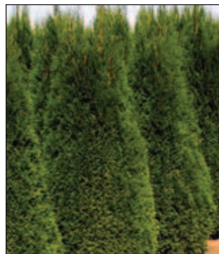
Thuja 'Emerald Green' Emerald Green Arborvitae

Emerald Green Arborvitae - Rich, dark green foliage. Pyramidal form. Attractive specimen, screen, or border plant. 15' Tall X 4' Wide. Zone 3. ☀️ Call for price - #3 Can 24/30" #3 Can 30/36" Call for price - #7 Can 3/4'