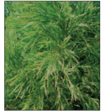
Cryptomeria 'Yoshino' Yoshino Japanese Cryptomeria