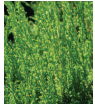
Juniperus 'Sea Green' Sea Green Juniper