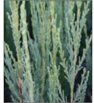
Juniperus 'Blue Arrow' Blue Arrow Juniper