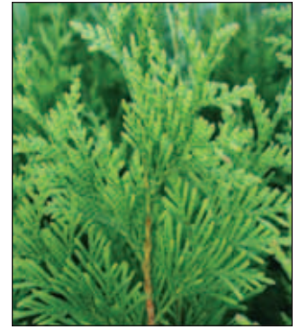
Thuja 'Steeplechase' Steeplechase Arborvitae