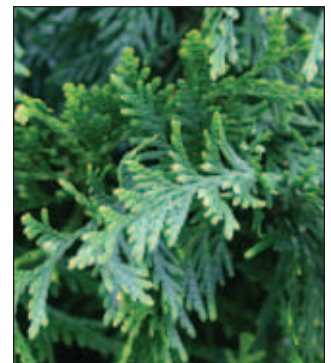
Thuja 'Green Giant' Green Giant Arborvitae