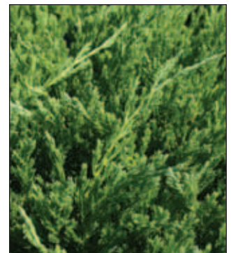
Juniperus 'Andorra Youngtown' Compact Andorra Juniper