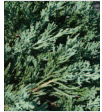
Juniperus 'Blue Rug' Blue Rug Juniper