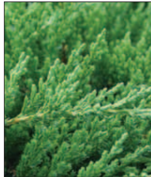
Juniperus 'Sargentii' Sargent Juniper

Sargent Juniper - Low, mounding habit with rich, bright green foliage. Excellent massing, ground cover plant. 12-18" Tall X 6-8'. Zone 4. ☀ 3D - #3 Can 12/15" #3 Can 15/18" #3 Can 18/21" #3 Can 21/24"