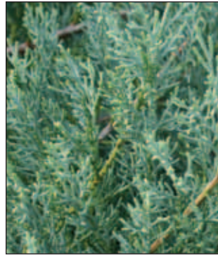
Juniperus 'Hetzi Blue' Hetzi Blue Juniper

Hetzi Blue Juniper - Semi-upright, vase-shaped grower. Steel-blue color. Good screen, hedge plant. 12-15' Tall X 10-15' Wide. Zone 4. ☀ 3E - #3 Can 12/15" #3 Can 15/18" #3 Can 18/21" #3 Can 21/24"