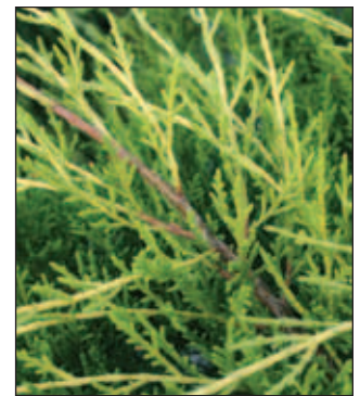
Juniperus 'Gold Coast' Gold Coast™ Juniper