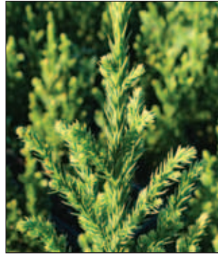
Cryptomeria 'Black Dragon' Black Dragon Japanese Cryptomeria

Black Dragon Cryptomeria - Dark green needle-like foliage. Wide pyramidal form. Good small garden, accent plant. 5-8' Tall X 7-10' Wide. Zone 5. ☀️☁️ 3Q - #3 Can 21/24"